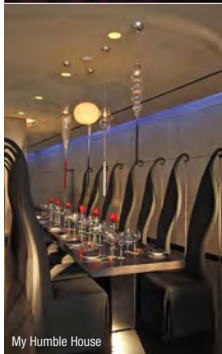
My Humble House