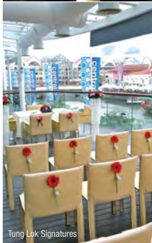
Tung Lok Signatures