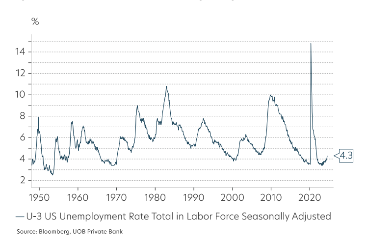
Figure 1: US unemployment rate edges higher

Global stock markets sold off sharply and bonds rallied after a string of weak US data reignited fears of a harder landing than previously anticipated. One of the key data that spooked hard-landing fears is the unemployment rate, which rose from 4.1% to 4.3% (Fig. 1). Historically, once the unemployment rate rises, it tends to continue rising until the economy gravitates into a recession. The set of weak data has led some banks to revise Fed's policy rate to a 50bp cut in the September meeting and another 50bp in November.